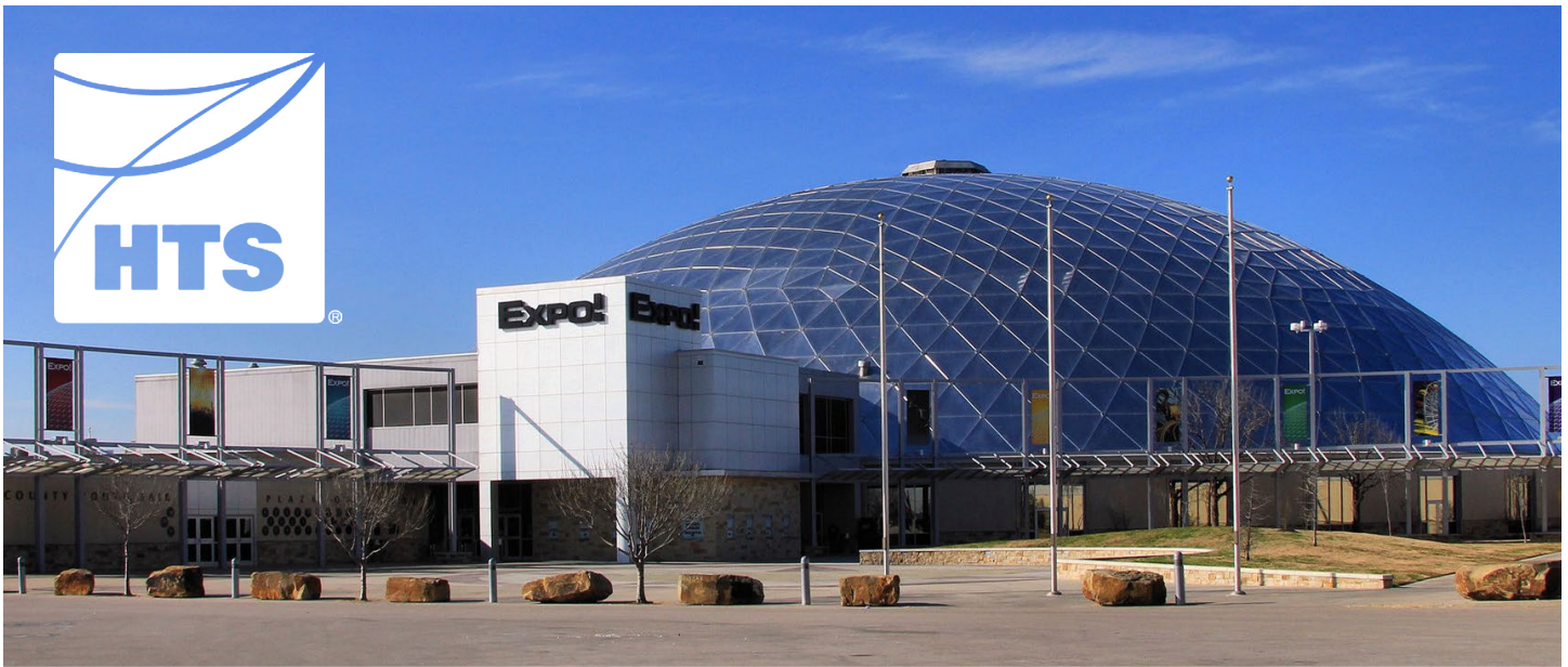
Using a Choice Partners contract, HTS helped renovate the Bell County Expo Center without canceling any of its 250 annual events.