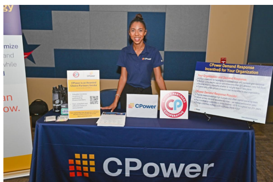
CPower, an awarded vendor for demand response services, hosts a booth at iPASS (contract #23/045MF-01).