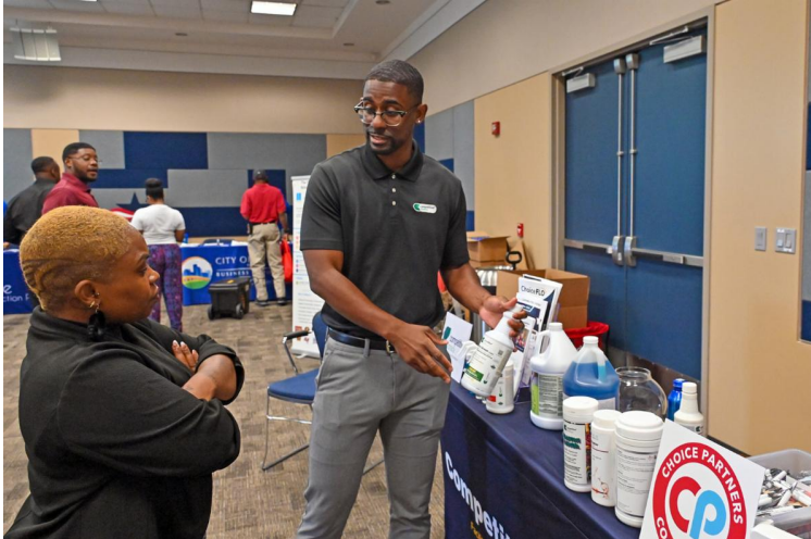
Competitive Choice, a CP awarded vendor, shows products to a potential customer (contract #24/023TC-06).

several CP awarded vendors, showcasing many products and services available to CP members.