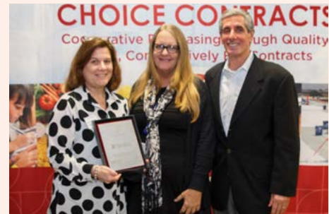
Tandus Centiva, a Tarkett company, is a flooring services (JOC-IDIQ) vendor with an excellent track record of quality and service.