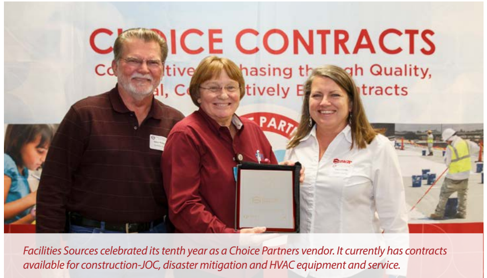
Facilities Sources celebrated its tenth year as a Choice Partners vendor. It currently has contracts available for construction-JOC, disaster mitigation and HVAC equipment and service.