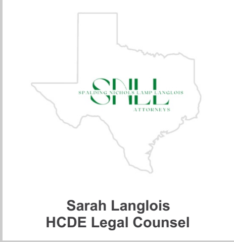
Sarah Langlois HCDE Legal Counsel

From a practical perspective, sellers should provide buyers with sufficient documentation that individual goods are subject to specific tariffs. Buyers and sellers should negotiate any changes to pricing in good faith, ideally with both sides sharing the increased costs.