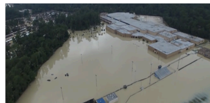
Kingwood Highschool After Harvey

During hurricane season, it is important to have an emergency plan in place to handle the after effects of storm damage. In the event of a natural or man-made event, Disaster Mitigation entails plans/strategies utilized to reduce the severity of human and material damage caused by the event. Choice Partners offers contract options designed to aid members several different ways when this occurs.